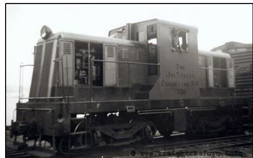
Jay Street Connecting Railroad No. 7511

One of the last military locomotives at Sandy Hook was USA/Transportation Corps No. 7511 built by Vulcan in 1944. Sold to the Jay Street Connecting Railroad in Brooklyn, it retained its army number. Later it saw service at the Houdaille Materials quarry at Martinsville. New Jersey.