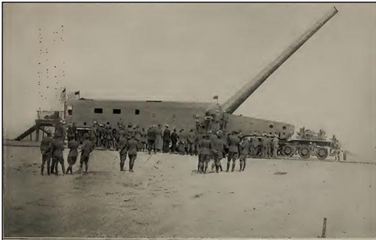
TEST OF FIRST MOUNT AT SANDY HOOK PROVING GROUNDS.

at Port Monmouth. In the 1890s, the federal government enlarged its holdings on Sandy Hook and the Central Railroad of New Jersey was forced to move its steamboat terminal to Atlantic Highlands. The military reservation on Sandy Hook included Fort Hancock and the Sandy Hook Proving Grounds where the Ordnance Department test fired artillery.