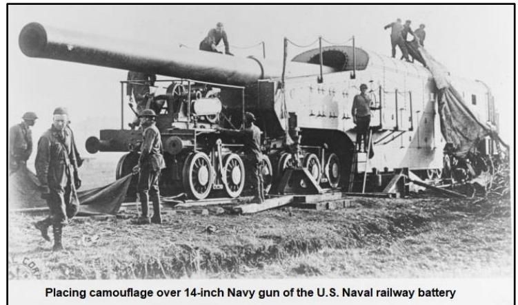
Placing camouflage over 14-inch Navy gun of the U.S. Naval railway battery

Visitors to Gateway National Park on Sandy Hook, NJ, can see the scars of railroad tracks in a few locations in the park. The railroad came to Sandy Hook in 1865 when the Long Branch and Seashore Railroad opened its road with a terminal at Spermacetti Cove on the Raritan Bay shores of the Hook. Passengers made the trip from the Hook to New York City by steamboat.