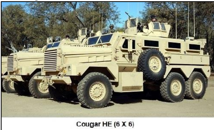
Cougar HE (6 X 6)

It is design and structured to be resistant to landmines and improvised munitions. One of the biggest enemies faced by the coalition troops in Iraq and Afghanistan is a hidden one: improvised explosive devices, or IEDs. The answer to this threat comes in the form of the Cougar, which looks especially monstrous in 6x6 form. There are variations of it serving in the British Army, including the Wolfhound.