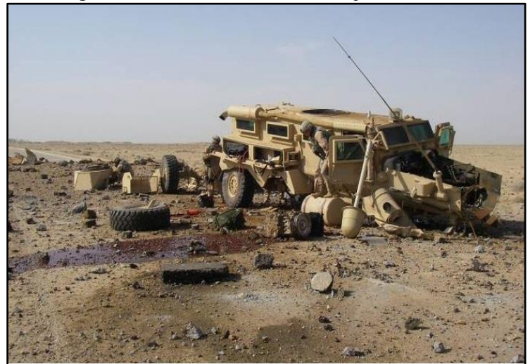
Cougar hit by 300–500 lb (140–230 kg) IED attack, all of the crew survived

Some 4,000 of these vehicles were fielded under the US military's MRAP and other vehicle programs. The US Secretary of the Defense at the time demanded that the vehicles be ordered in larger numbers after the Marines reported in 2004 that no troops had died in more than 300 IED attacks on Cougars. Since then, Cougar vehicles have been hit by IEDs many times in Iraq with few fatalities. Official data states that the Cougar is able to withstand a blast of at least 14 kg (30.86 lb) TNT under a wheel and 7 kg (15.43 lb) TNT under a belly.