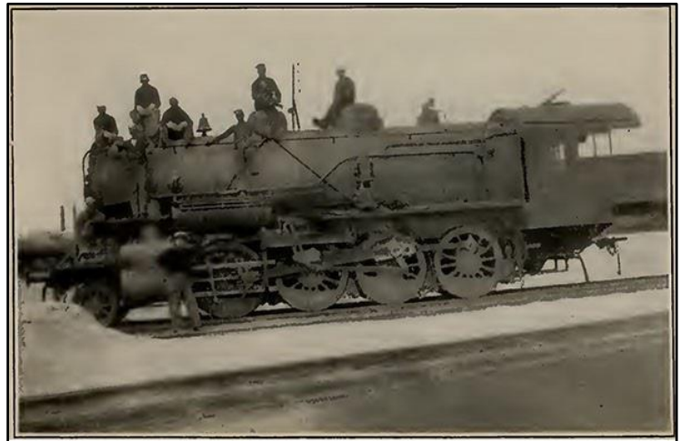
Assembling a Battery 2-8-0 Locomotive

The Navy guns were capable of firing a shell 30 miles when the guns were elevated to 45 degrees. When fired at low angles, the entire weight of the gun was carried by the trucks. At an angle of elevation of 15 to 45 degrees, a structural steel foundation, surrounding a recoil pit, was necessary for the purpose of absorbing a part of the shock and to provide room for recoil of the gun. The construction of a semicircular track was necessary to permit aiming the gun.