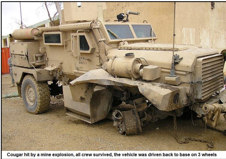
Cougar hit by a mine explosion, all crew survived, the vehicle was driven back to base on 3 wheels

4x4 and 6x6 variants for the US Army, USAF, and USMC. Approx. 200 ordered in 2005 and 2006, with another 200 ordered in late 2006 but now called MRAPs to take account of the new US military/political initiative to be seen to be responding to public concerns about casualties.