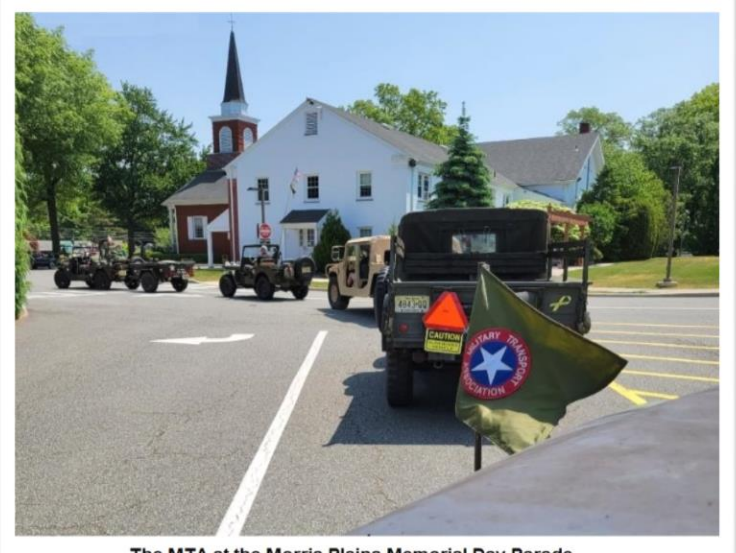
The MTA at the Morris Plains Memorial Day Parade

<u>Quartermaste</u> r: We still have some inventory on green shirts and a few hats. Once depleted a new order will be placed.