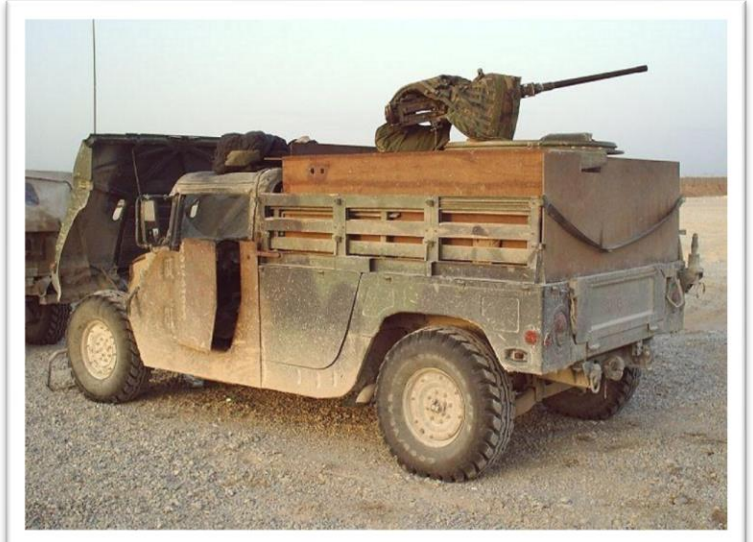
A typical gun-truck on the HMMWV basis, basic version M998. The vehicle is equipped by armor plates, creating a secure space for the soldier up to the driver's cabin. Armor also creates provisory driver and passenger doors and the car is as well mounted with a heavy 12,7 mm machine-gun Browning M2HB.

When it comes to materials and procedures used in building these "gun-trucks", they're almost always the same. The most common material used are the steel plates, often scavenged from transportation containers and discarded vehicles. Plus, the US Army bought specially for these purposes plates made of Swedish armor steel ARMOX and HARDOX. The plates (no matter their origin) were then attached to the car's body to protect the crew, engine, tank etc.