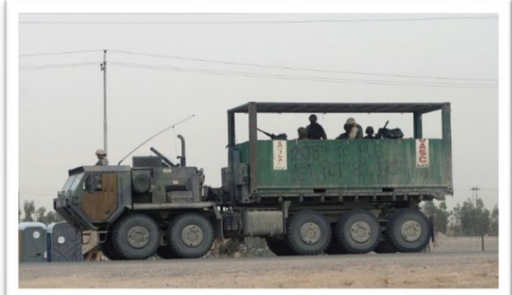
The biggest gun-truck on record in Iraq was created as a conversion of the PLS truck, very similar to the HEMTT, only with two more wheels and a pallet platform. On this platform, the soldiers have installed an armored superstructure with carriages for heavy 12,7 mm M2HB machine-guns and automatic grenade launchers Mk 19.

In the meantime, American soldiers had to somehow survive until these upgraded armored vehicles arrived. So like their comrades that fought in Vietnam, they got crafty. And their ingenuity lead to the birth of these technically interesting improvisations, that surely helped in saving hundreds and thousands of men and women.