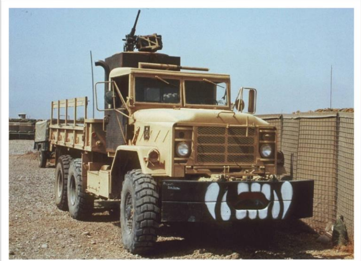
But the US Army infantry is not the only one who uses self-improved guntrucks. The Special Forces use them as well, as seen on this picture of a M925A1 truck, which belongs to the Fifth Unit of the Special Forces. We can see not only the armored driver's cabin and the 12,7 mm M2HB machine-gun turret, but also an unusual reinforced bumper as well.

Following the US invasion of Iraq in 2003, and the fairly quick overthrow of Saddam Hussein and his régime, the optimistic concepts and plans about developing the country of Iraq proved to be more difficult than originally believed. Instead of relaxing the circumstances, hostilities between various parties erupted. An uncivilized conflict between tribes, clans, gangs and militia groups created an ambiguous environment where many American soldiers were killed or wounded in attacks on military vehicles. Most of these vehicles were not designed to operate in zones of combat.