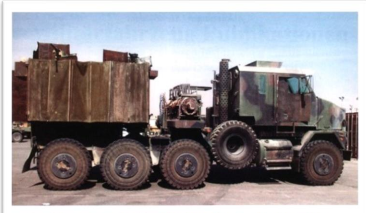
Another example of a Gun Truck from the Iraq War