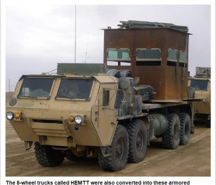
The 8-wheel trucks called HEMTT were also converted into these armored improvisations. This specimen's loading platform was upgraded by a "tower", enabling firing in all directions. It can be assumed that a vehicle modified in this way was used as a patrol car in dangerous areas.

Other types of vehicles, especially heavy trucks, suffered heavy losses as well. The US Army quickly took action. It soon ordered the standardized armor kits, socalled ASK (Armor Survivability Kit), which improves the level of protection of ordinary vehicles. Also, the Army began to buy armored versions of the Humvee as well as special armored automobiles called MRAP (Mine-Resistant Ambush Protected).