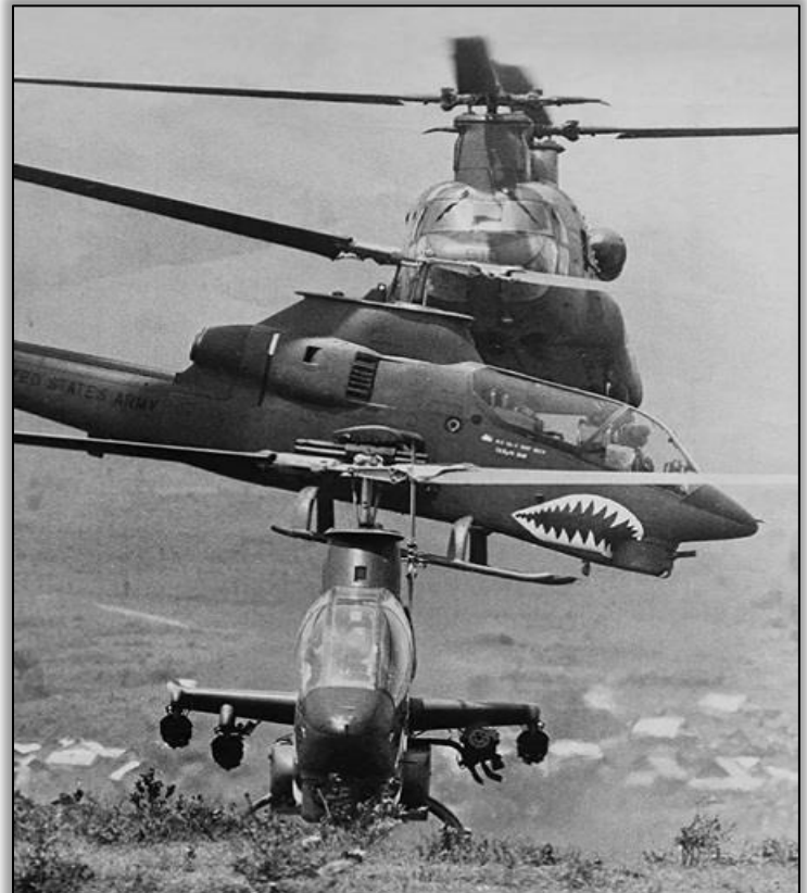
Cobras were the muscle for many missions. In April 1971, these Snakes escorted CH-47 Chinooks as they flew commandos into Laos.

On Sept. 4, 1967, a lone Bell AH-1G Huey Cobra Helicopter in flight to Muc Hoa, Vietnam noticed a Chinese sampan boat carrying four armed Viet Cong on the waterway below. The 1st Aviation Brigade commander on board the Cobra gave the order to attack. He achieved the recently deployed Cobra's first combat kill in Vietnam, by sinking the sampan and killing its crew with both rocket and machine gun fire. The day of the specifically designed attack helicopter had arrived.