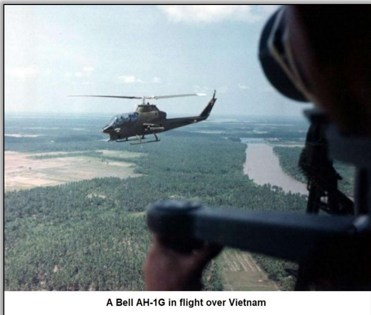
A Bell AH-1G in flight over Vietnam