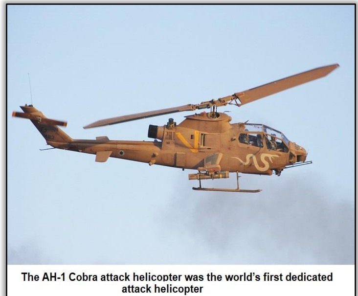
The AH-1 Cobra attack helicopter was the world's first dedicated attack helicopter