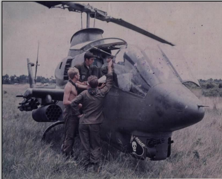
The commanders of the Mission Command and Control ship confers with the leader of the AH-1G Cobra gunships from the 235th Aviation Company (AH), 214th Combat Aviation Battalion, 164th Combat Aviation Group, 1st Aviation Brigade

The U.S. Air Cavalry’s “hunter-killer” tactics worked well for a few years, but by the time the United States left Vietnam, it was obsolete.