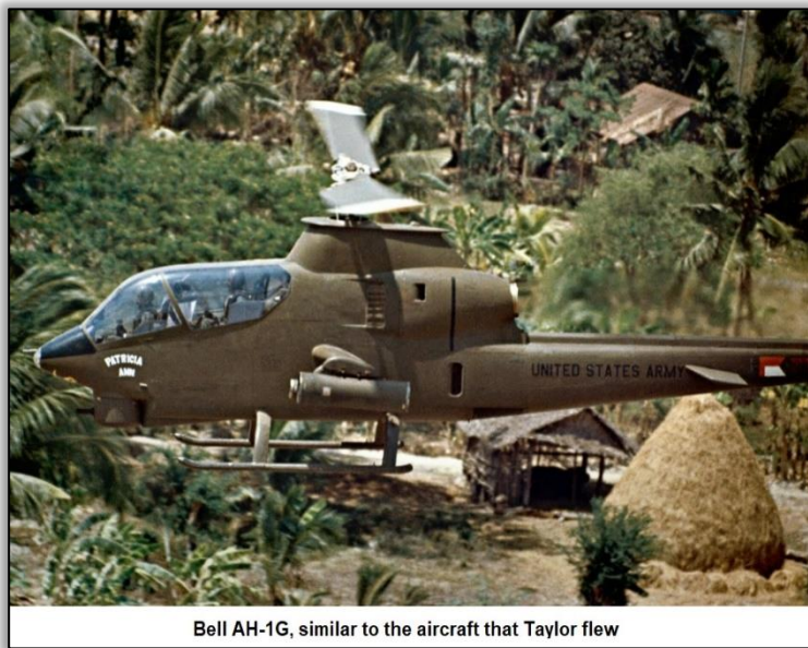
Bell AH-1G, similar to the aircraft that Taylor flew

Taylor devised a plan to extract the four LRRPs himself – a mission that has never been attempted while using the two-seater Bell AH-1G. Using the Bell AH-1G’s landing lights to distract the enemy, the LRRPs quickly ran to the extraction point that Taylor designated. As the LRRPs reached the designated site, Taylor landed the Bell AH-1G where two of the LRRPs quickly grabbed onto the rocket pods while the other two clung to the skids. Taylor then proceeded to successfully fly all four men to a safe location.